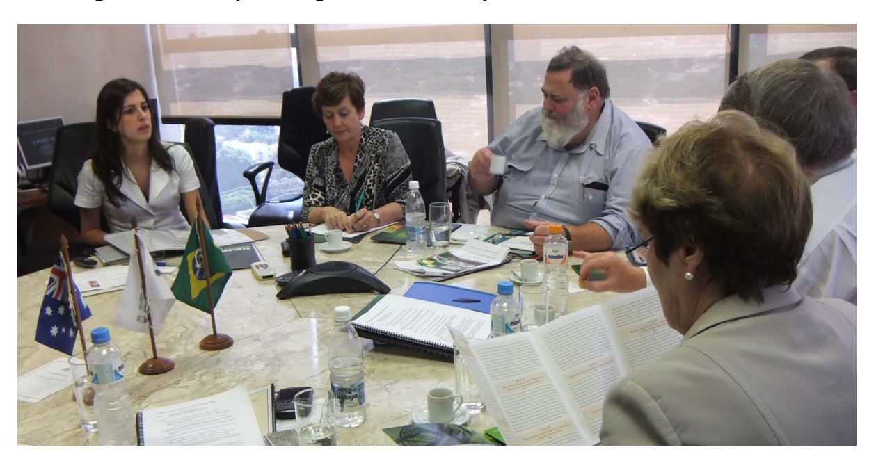
The delegation's meeting with the Brazilian Sugar Cane Industry Union UNICA