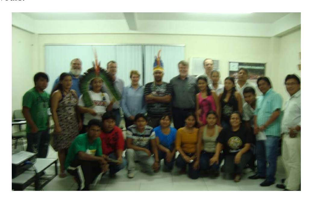
The Delegation with representatives from Co-ordination of Indigenous Organisations of the Brazilian Amazon (COIAB)

7.97 The Speaker also acknowledged the presence at the meeting of students from the Amazon Indigenous Training Centre (CAFI). CAFI offers a nine month training program that aims to empower a new generation of leaders for the conservation of indigenous land in the Amazon. The Speaker said that equipping young indigenous people to speak for themselves and engage effectively on behalf of their communities was a highly important initiative. He congratulated the students on being nominated for the program and wished them and the program coordinators well in their endeavours.