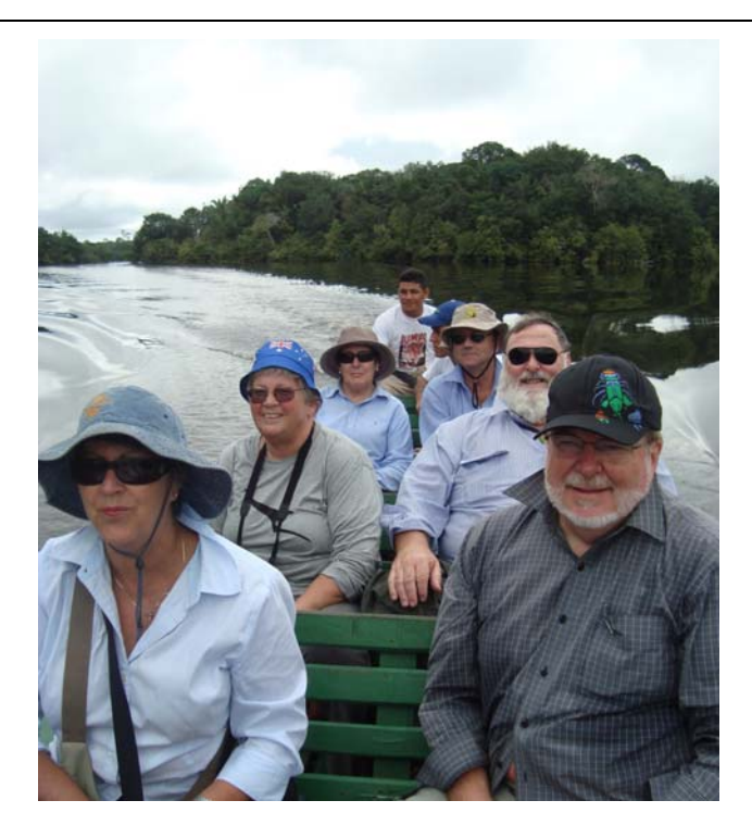
The delegation en route to Juma Lodge