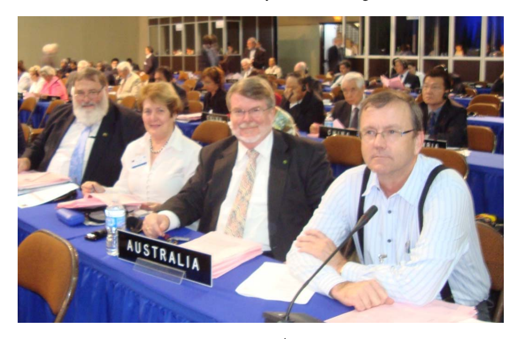
The Australian Delegation during the 188<sup>th</sup> Session of the Governing Council

covered by the strategy and voluntary funding would need to be identified to implement additional activities not funded by the core budget.